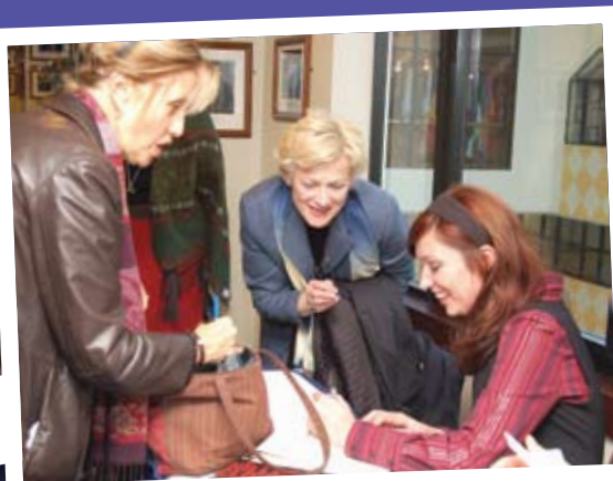
Carpenter signs books for attendees